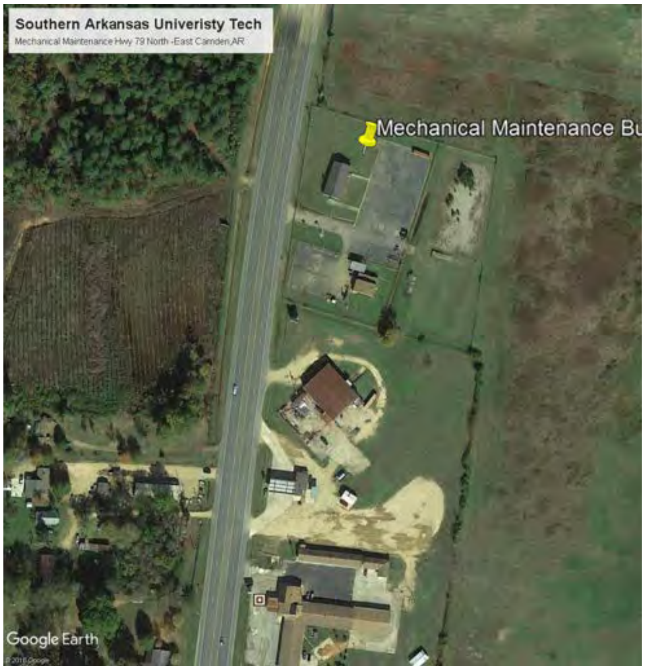
SAU Tech Mechanical Maintenance Building Hwy 79 N East Camden, AR.