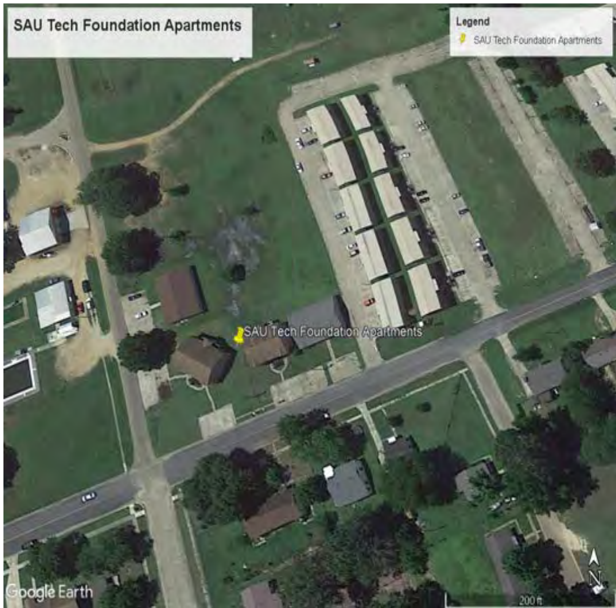
SAU Tech Foundation Apartments Corner of North Womble and Busbee East Camden, AR.