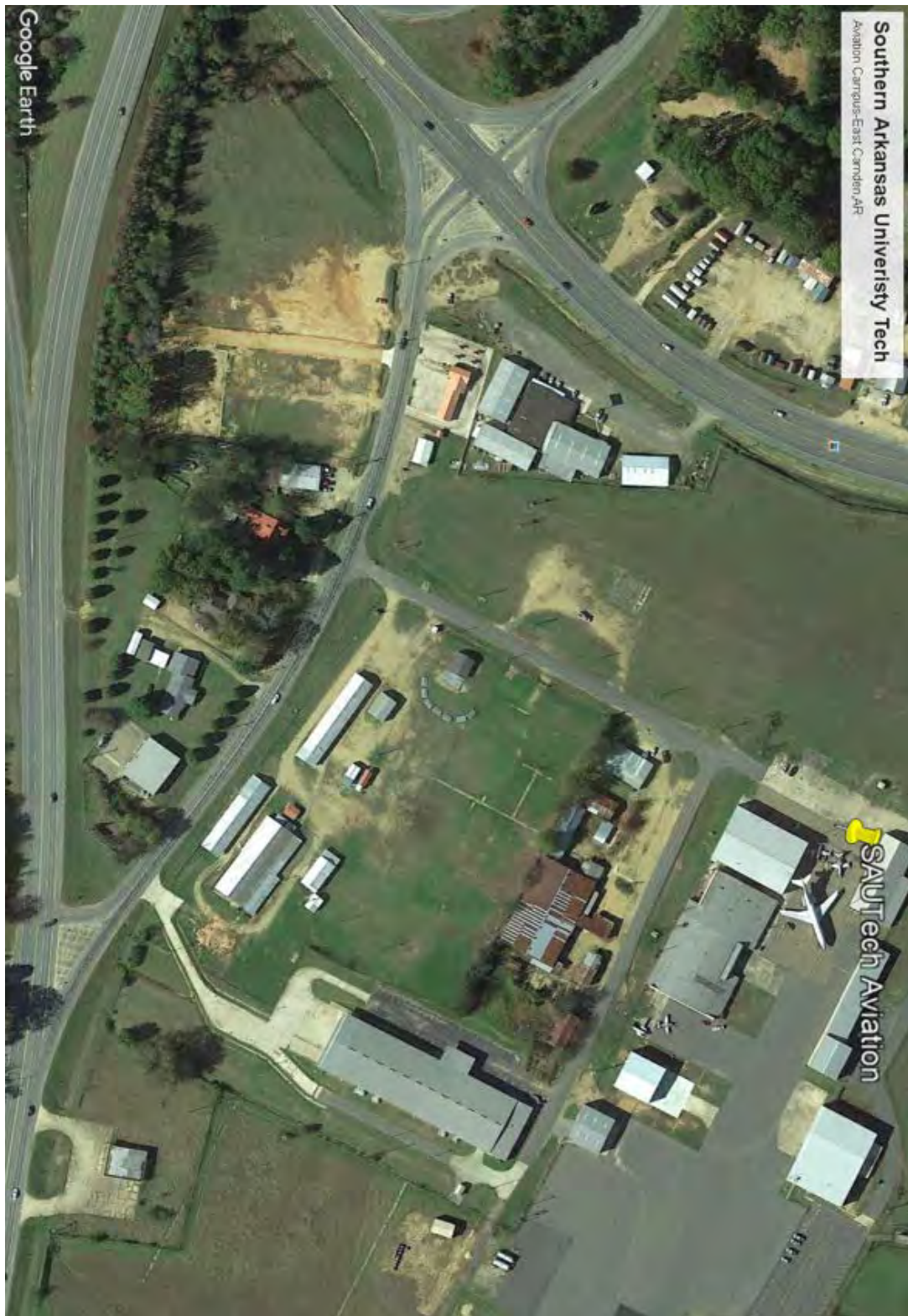
SAU Tech Aviation Hanger East Camden on Hwy US 79