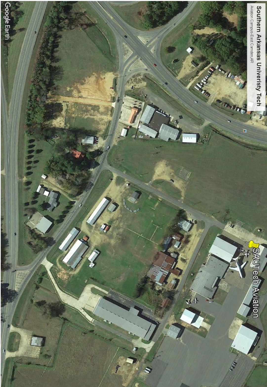
SAU Tech Aviation Hanger East Camden on Hwy US 79