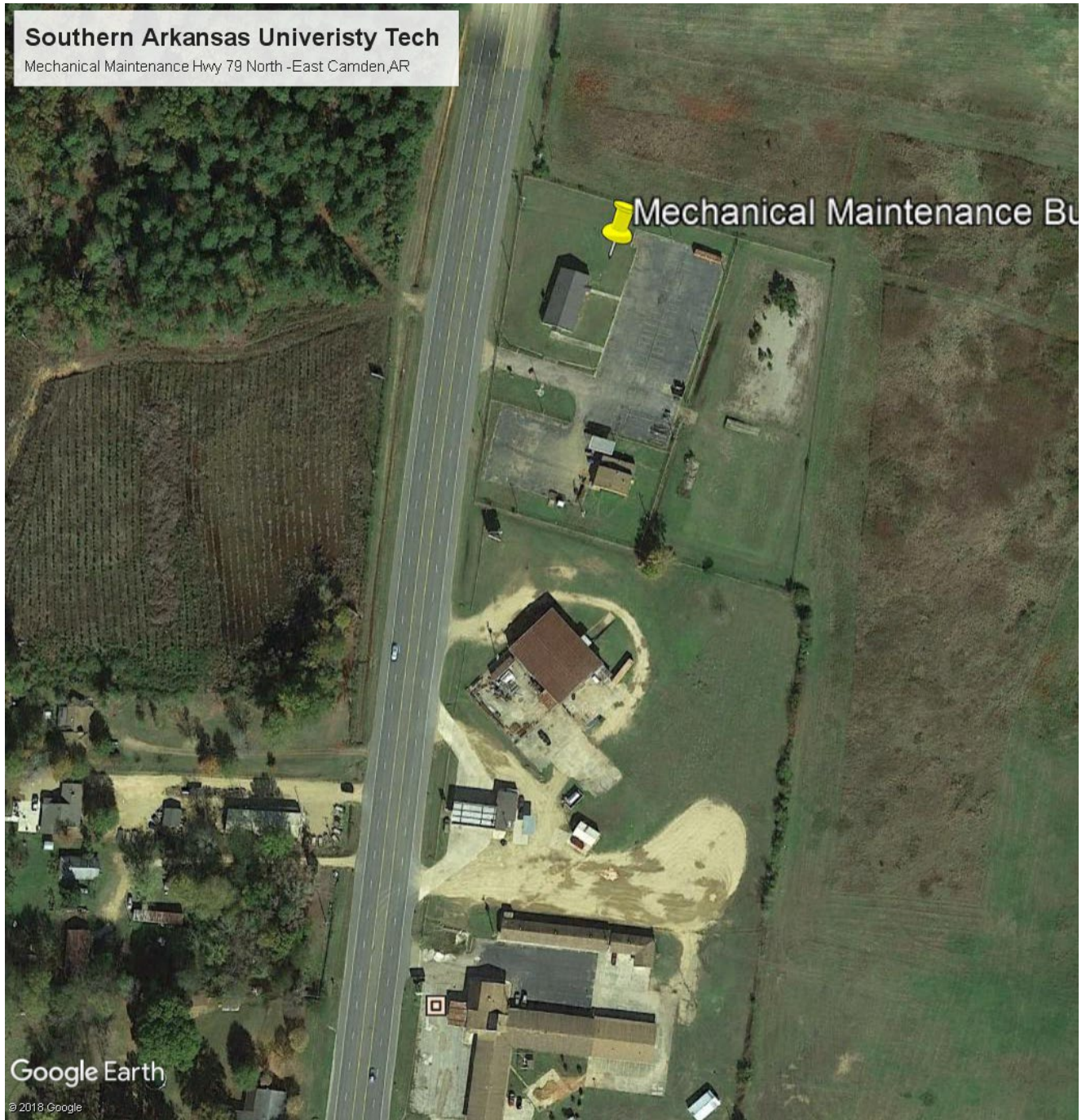
SAU Tech Mechanical Maintenance Building Hwy 79 N East Camden, AR.

Mechanical Maintenance Hwy 79 North -East Camden,AR