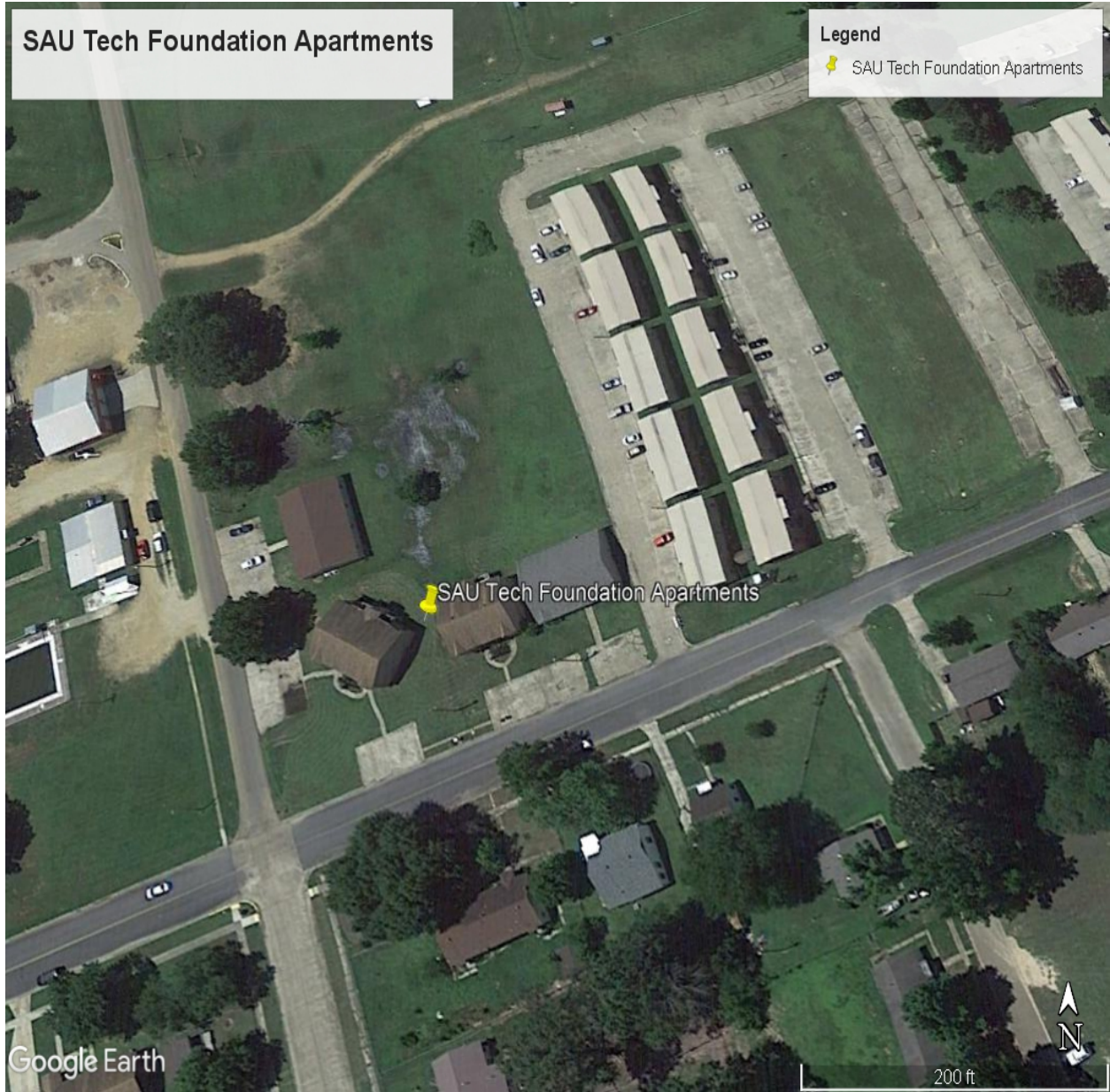
SAU Tech Foundation Apartments Corner of North Womble and Busbee East Camden, AR.